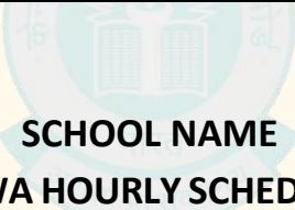
Annexure 4 -SEWA Hourly Schedule